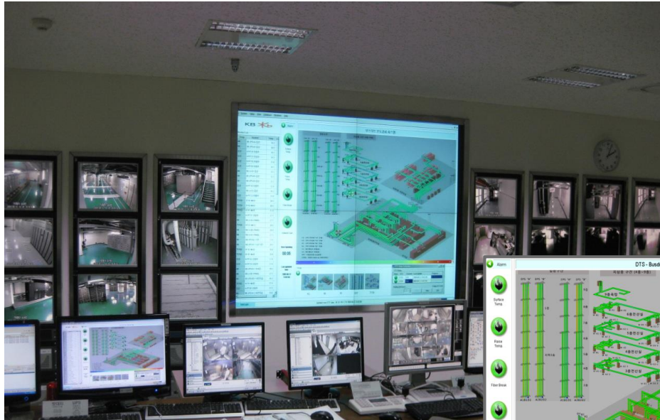
Central Control Room