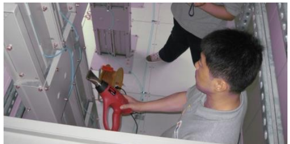
Commissioning and testing phase