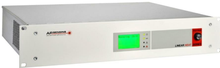
Linear Heat Series instrument